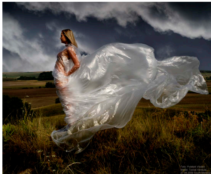
Mesto: Týnská věž, 27. 08. 2009, South-Moravia